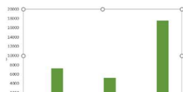
This chart shows the different “spend bands” in x-axis and the number of transactions in that spend band in y-axis.

The manager approaches the analytics team with the problem and shares the data with the team. The data has the amount and the amount band and a flag to mark the fraud transactions. The analytics team explores the data to treat the data for missing values and outliers . The team comes out with visualization. One of the visualization is shown below -